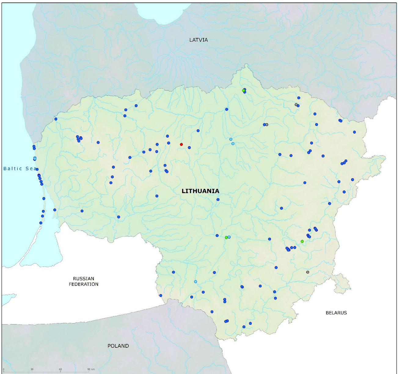
Map 1: Bathing waters reported during the 2021 bathing season in Lithuania