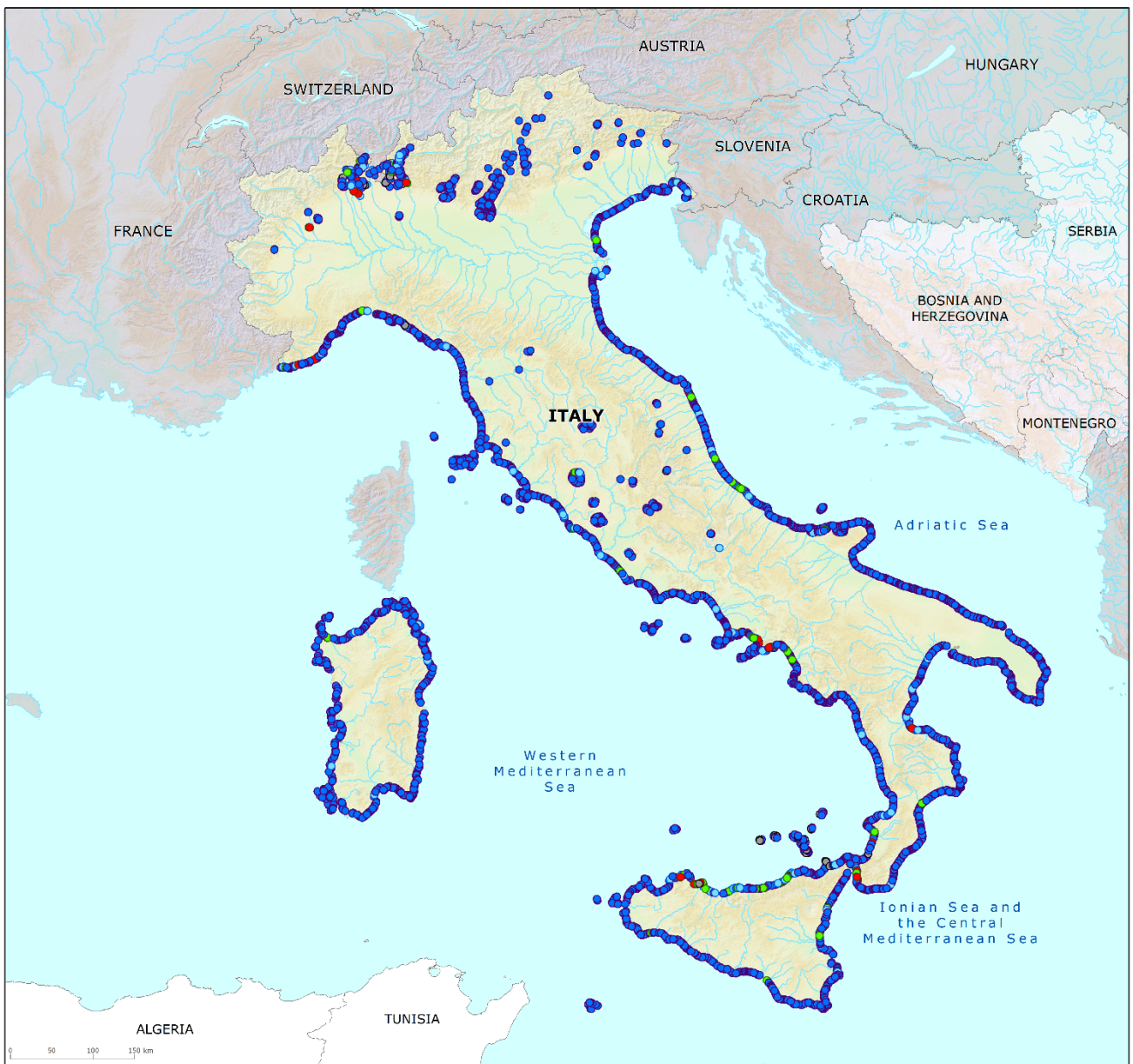
Map 1: Bathing waters reported during the 2021 bathing season in Italy