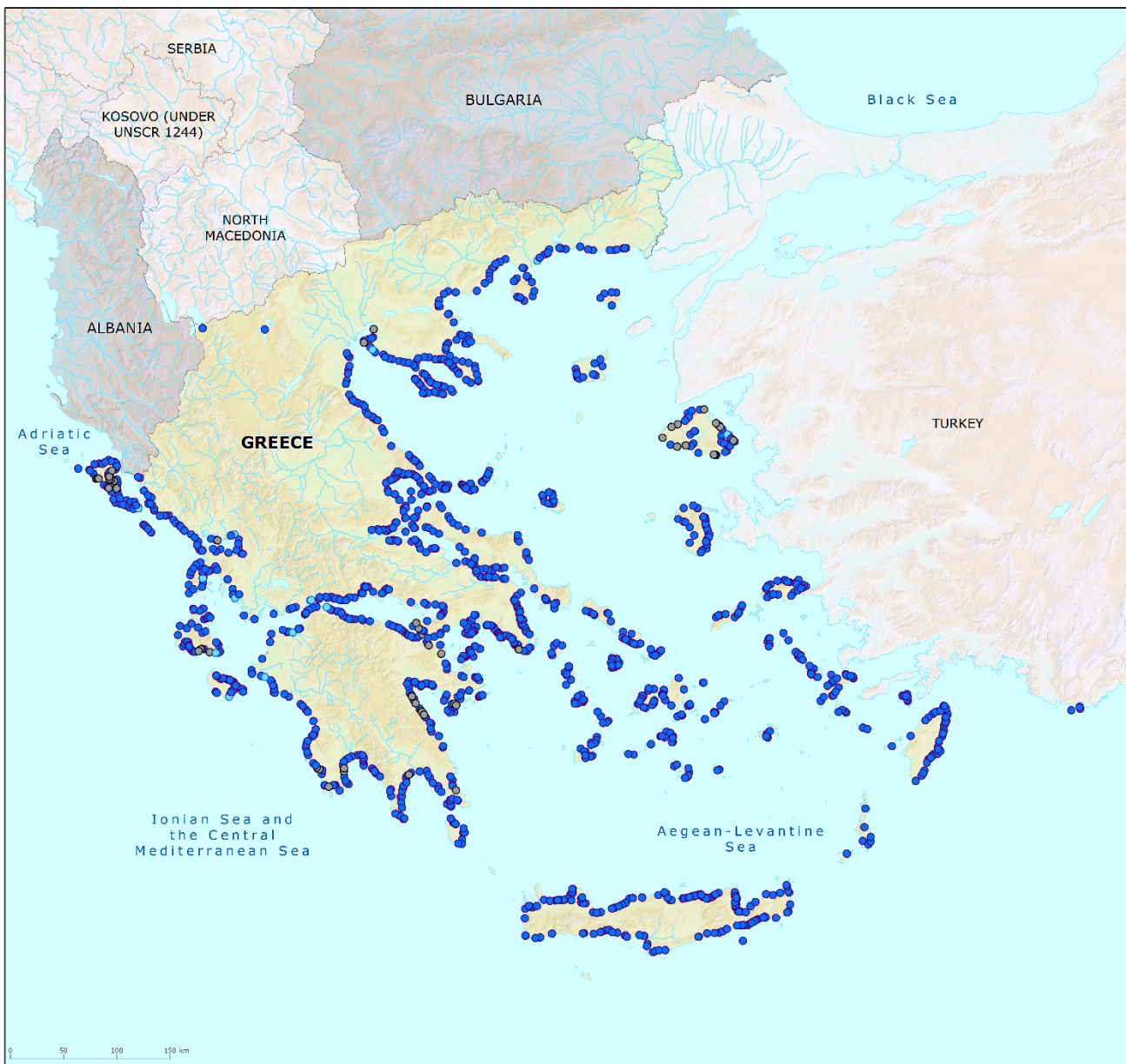
Map 1: Bathing waters reported during the 2021 bathing season in Greece