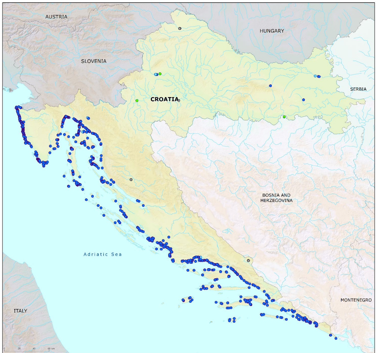
Map 1: Bathing waters reported during the 2021 bathing season in Croatia