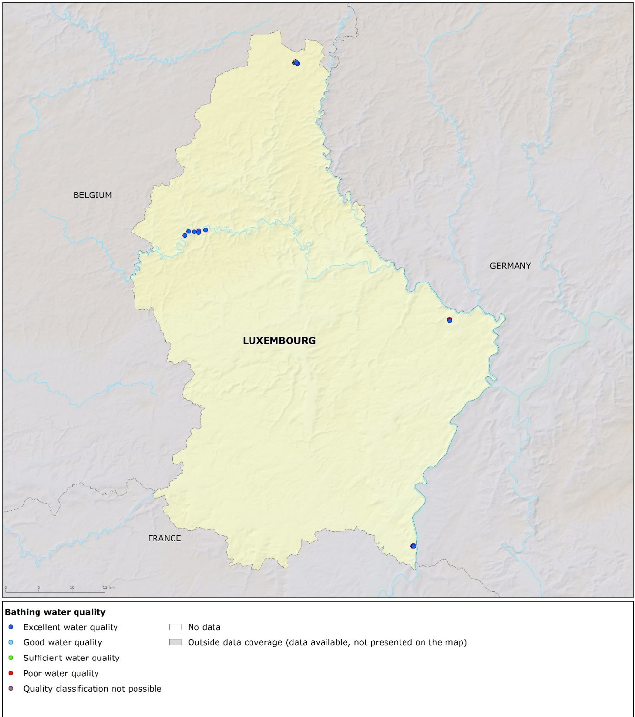
Map 1: Bathing waters reported during the 2020 bathing season in Luxembourg