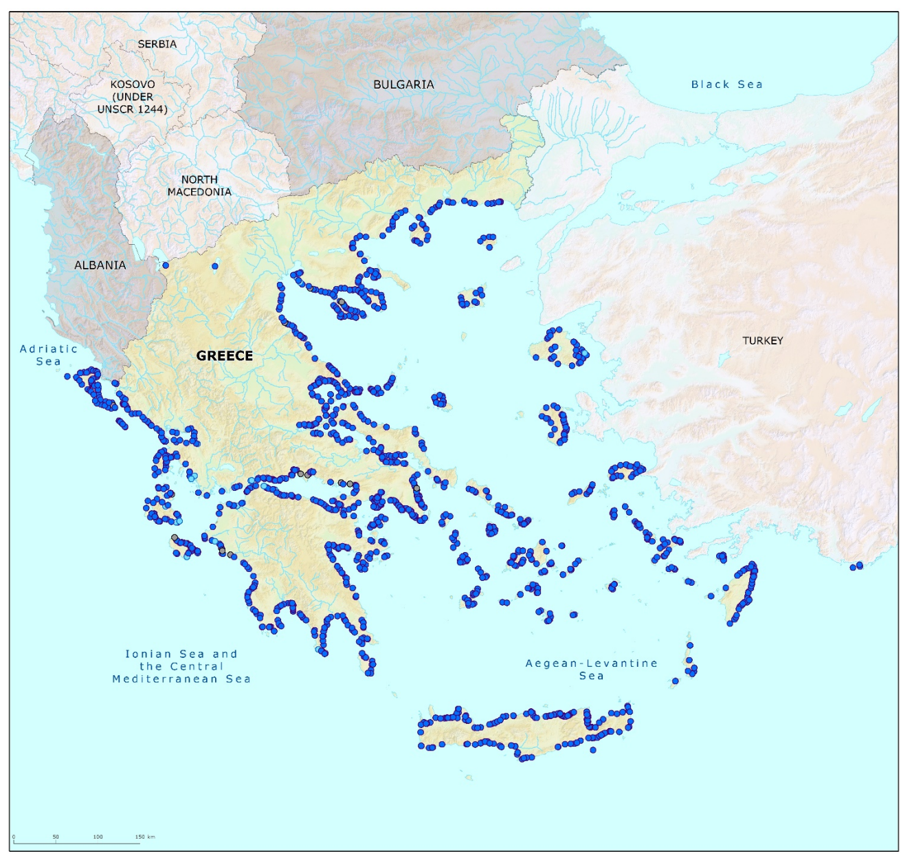
Map 1: Bathing waters reported during the 2020 bathing season in Greece