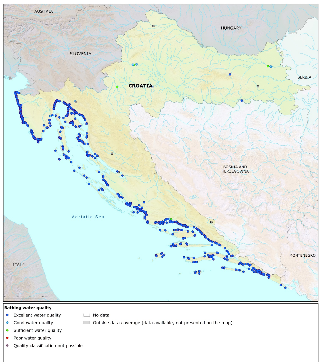
Map 1: Bathing waters reported during the 2020 bathing season in Croatia