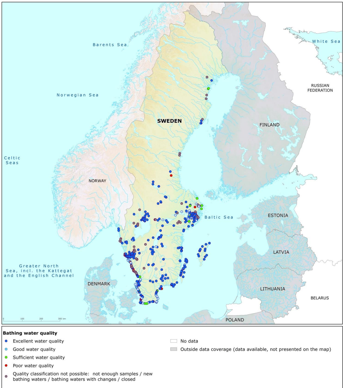
Map 1: Bathing waters reported during the 2015 bathing season in Sweden