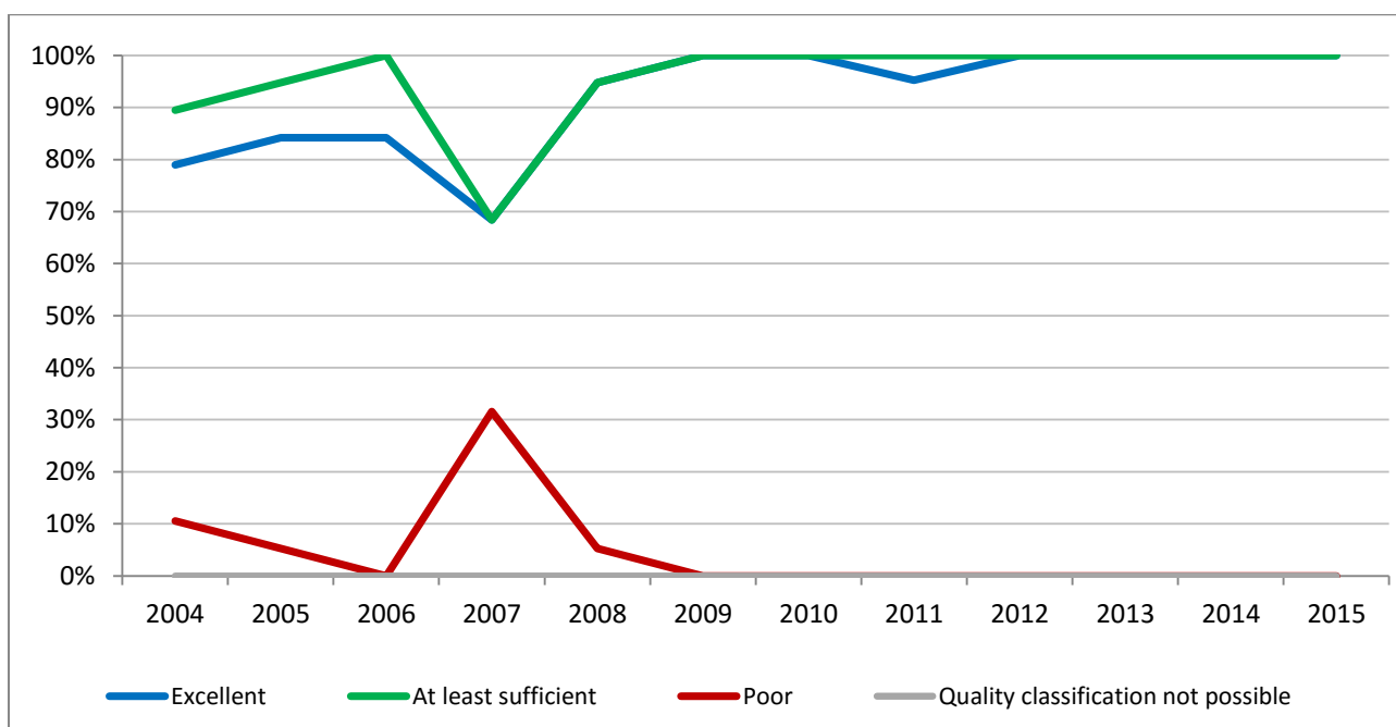
Figure 1: Coastal bathing water quality trend in Slovenia. Note: the “At least sufficient” class also includes bathing waters of “Excellent” quality class, the sum of shares is therefore not 100%.

In Slovenia, all existing coastal bathing waters met at least sufficient water quality standards in 2015. See Appendix 1 for numeric data.