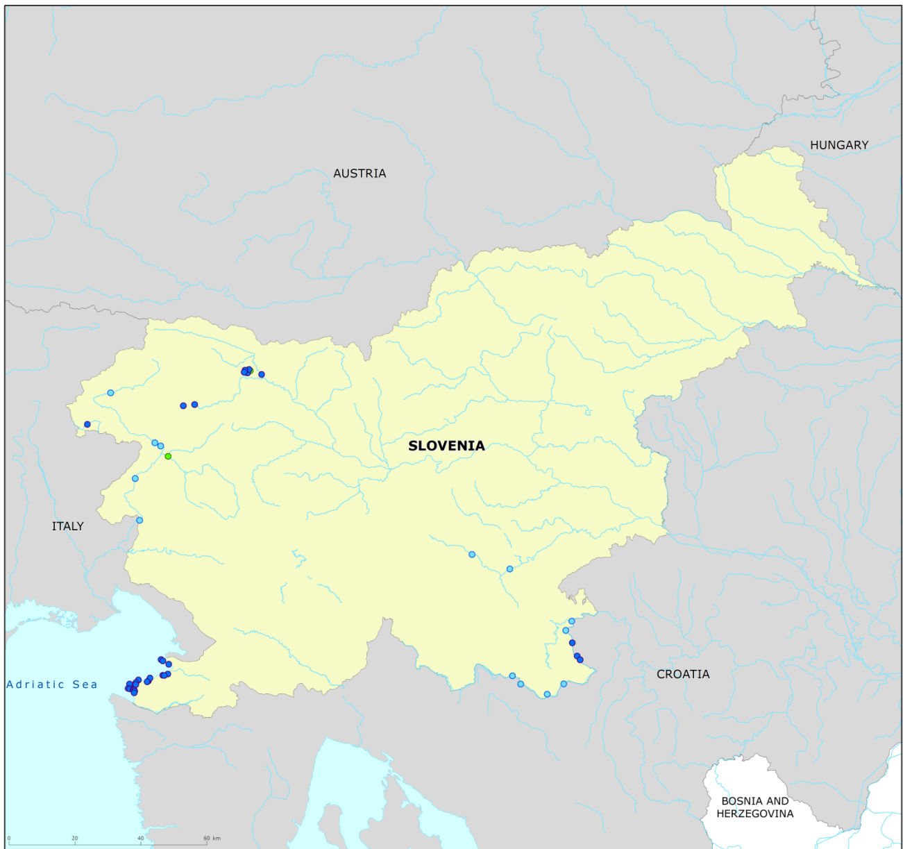
Map 1: Bathing waters reported during the 2014 bathing season in Slovenia