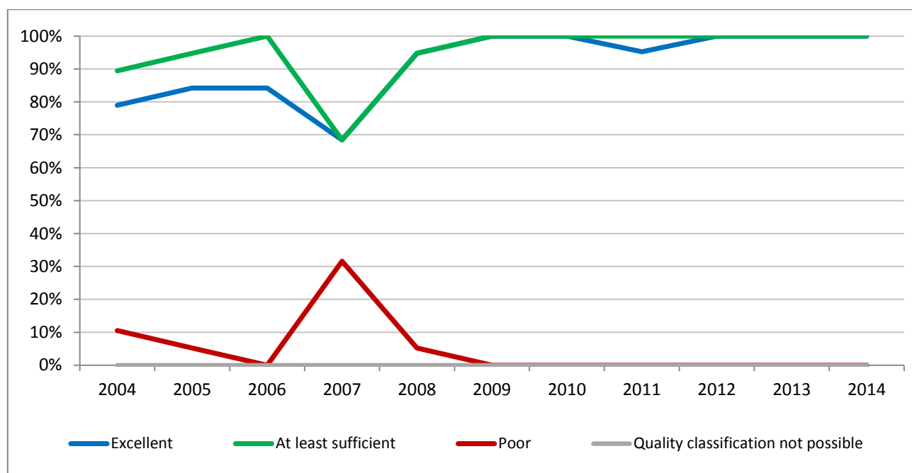
Figure 1: Coastal bathing water quality trend in Slovenia. Note: the "At least sufficient" class also includes bathing waters of "Excellent" quality class, the sum of shares is therefore not 100%.

In Slovenia, all existing coastal bathing waters met at least sufficient water quality standards in 2014. See Appendix 1 for numeric data.