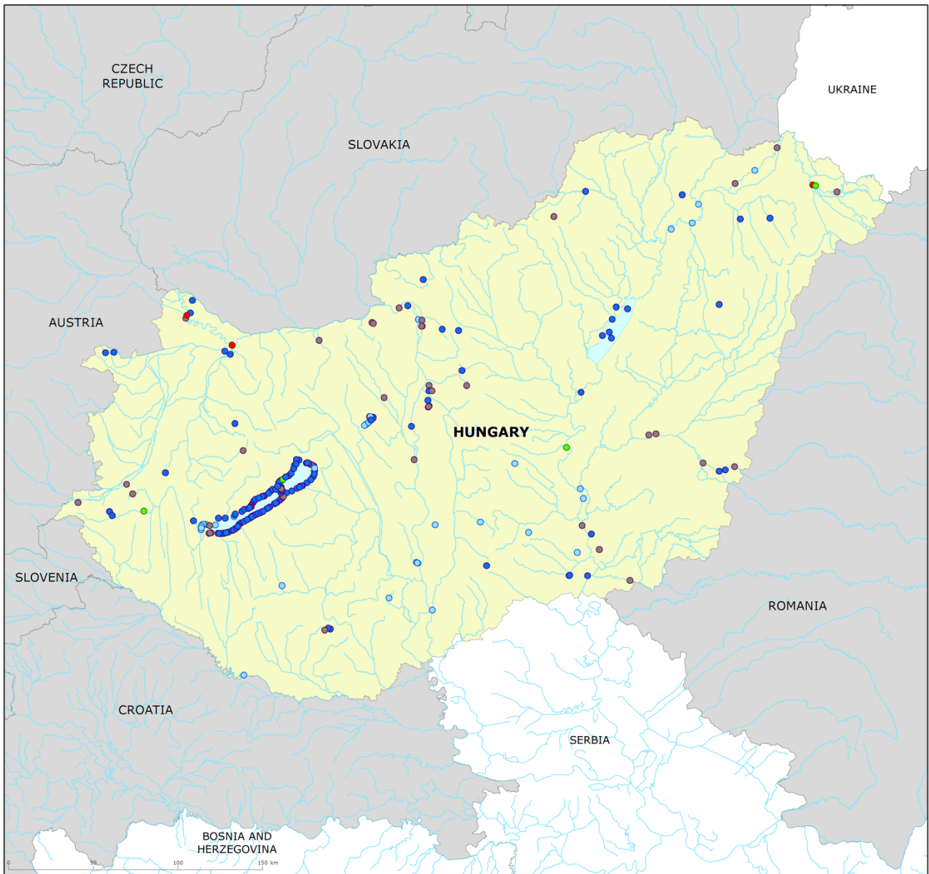
Map 1: Bathing waters reported during the 2014 bathing season in Hungary