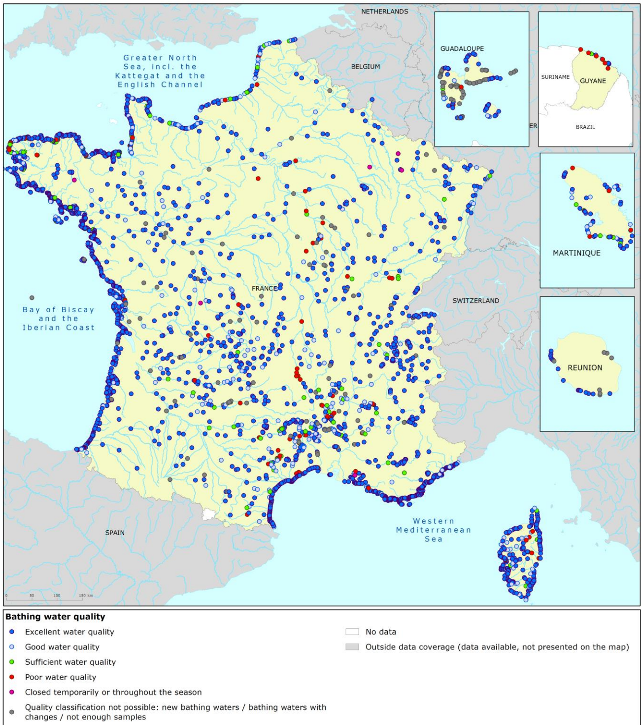
Map 1: Bathing waters reported during the 2013 bathing season in France