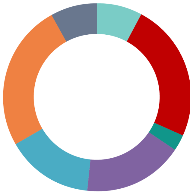
Figure 1: Breakdown of expenditure on waste prevention in 2019