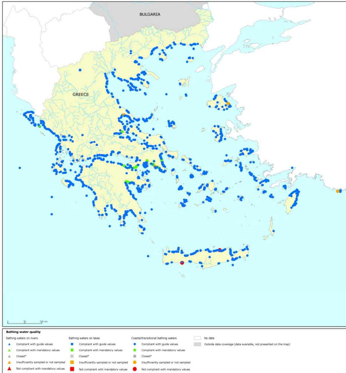
Map 1: Bathing waters reported during the 2008 bathing season in Greece