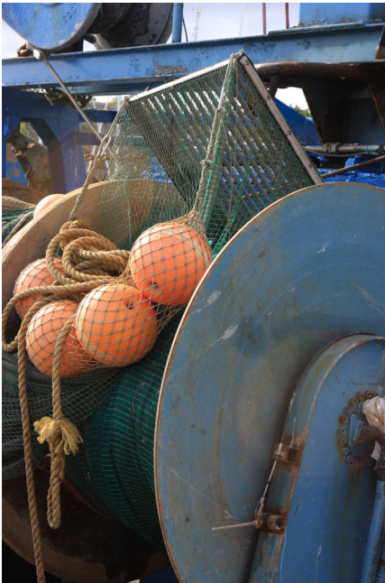
Photo: Ferder fishing gear showing aluminium grid designed to reduce by-catch

The fishermen have then organised courses for local researchers and politicians to inform them on their experience, life-style, and the fish and sea-food they were currently fishing. The fishermen also take the researchers and politicians on fishing trips to show how shrimp are caught with the less damaging