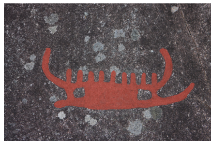
Photo: Njord quality label inspired by the rock carvings at Tanum © Gordon McInnes