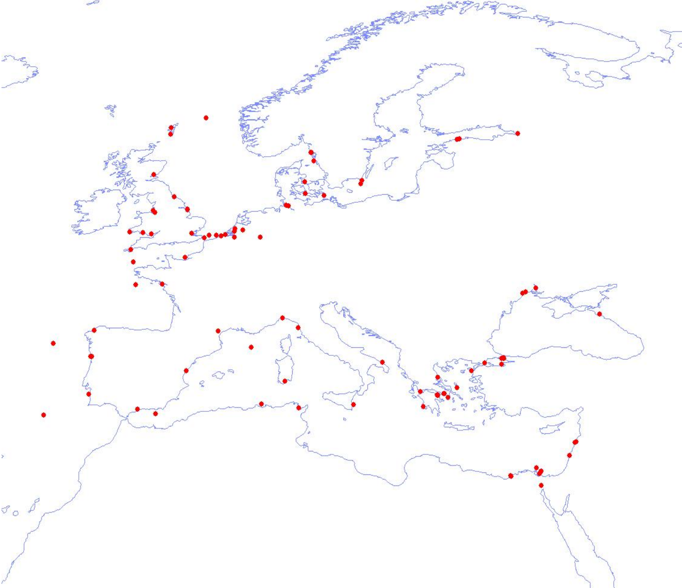
Fig 4. Large (> 7 tonnes) tanker spills in European waters 1990 – 2005