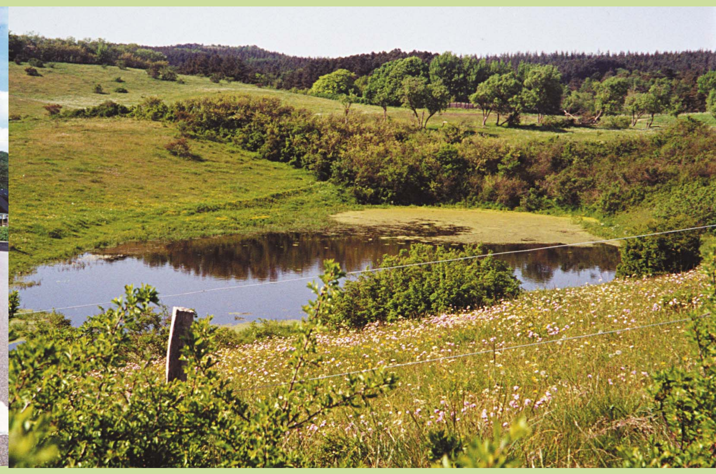
Grasslands and wetlands

Europe has 11 biogeographical regions and 7 regional seas with very different biodiversity and different pressures