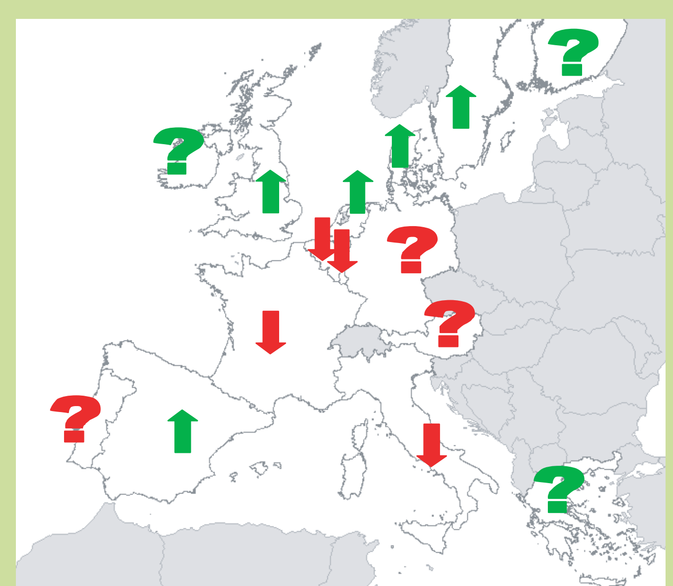
Compiled by ETC/NPB