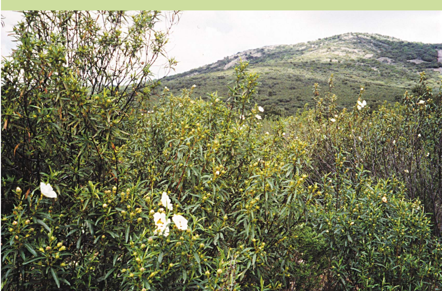
Dry mountains and forests