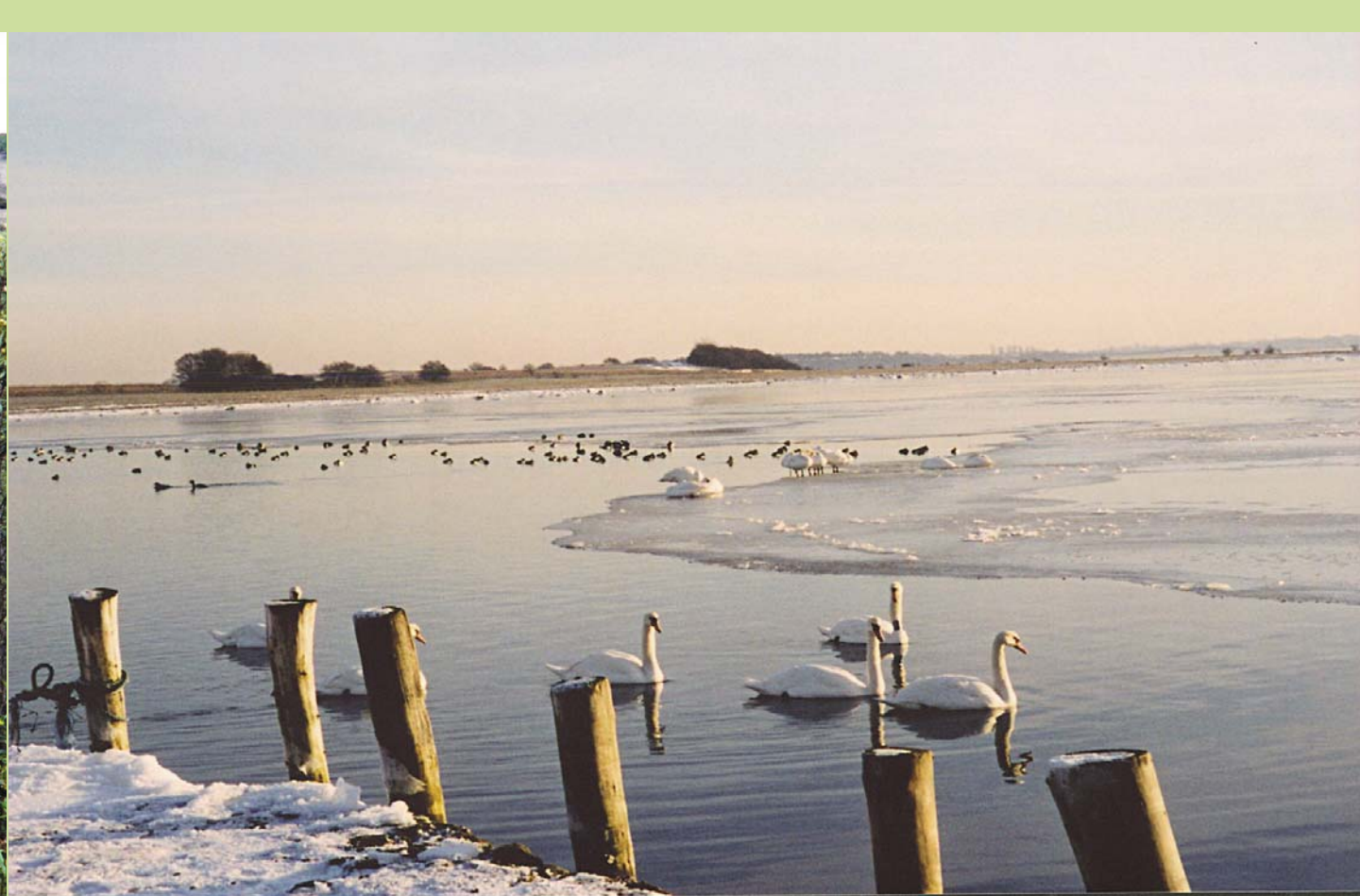
Coasts and seas