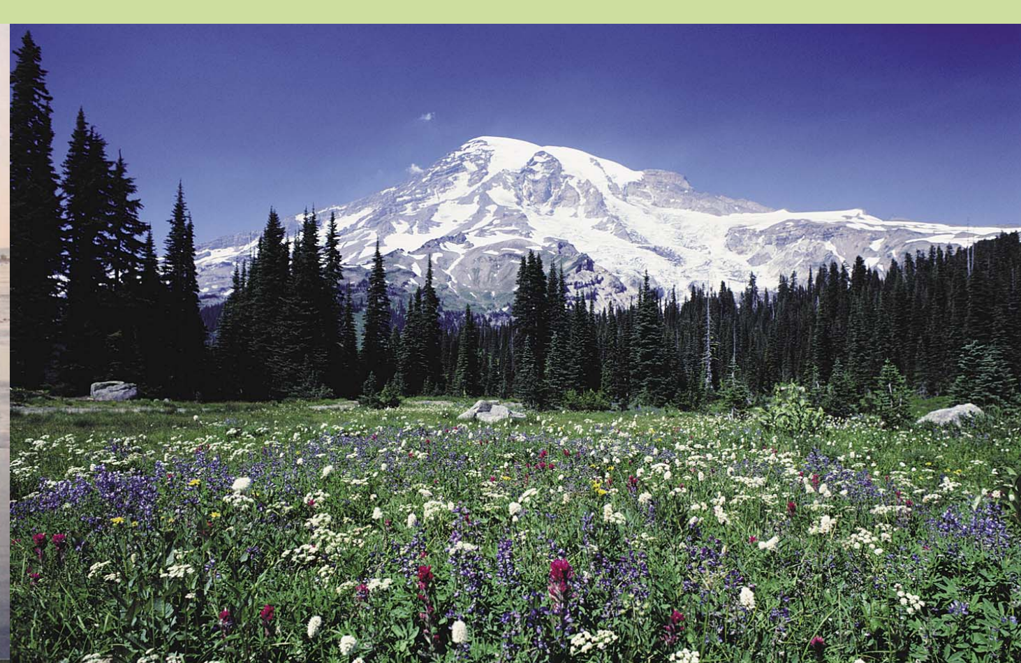
Glaciers and mountain meadows

European Environment Agency www.eea.eu.int