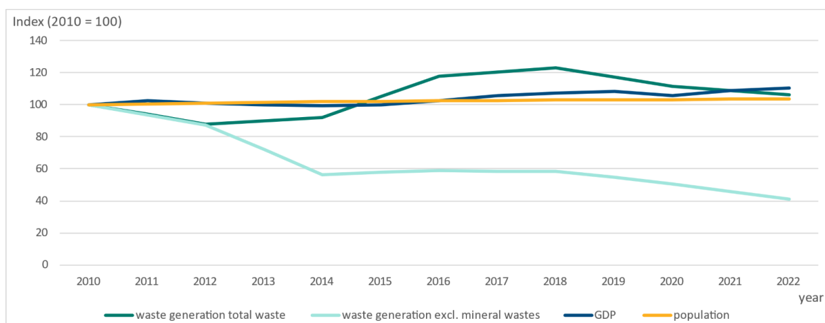
Figure 2 Generation of waste (total and excluding major mineral wastes), population and economic development, 2010-2022

Source: Eurostat [ENV_WASGEN, NAMA_10_PC, DEMO_GIND].