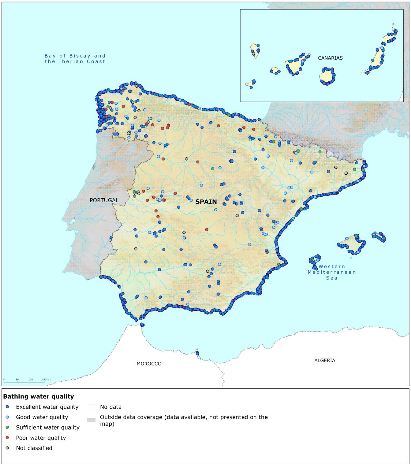
Map 1: Bathing waters reported during the 2023 bathing season in Spain