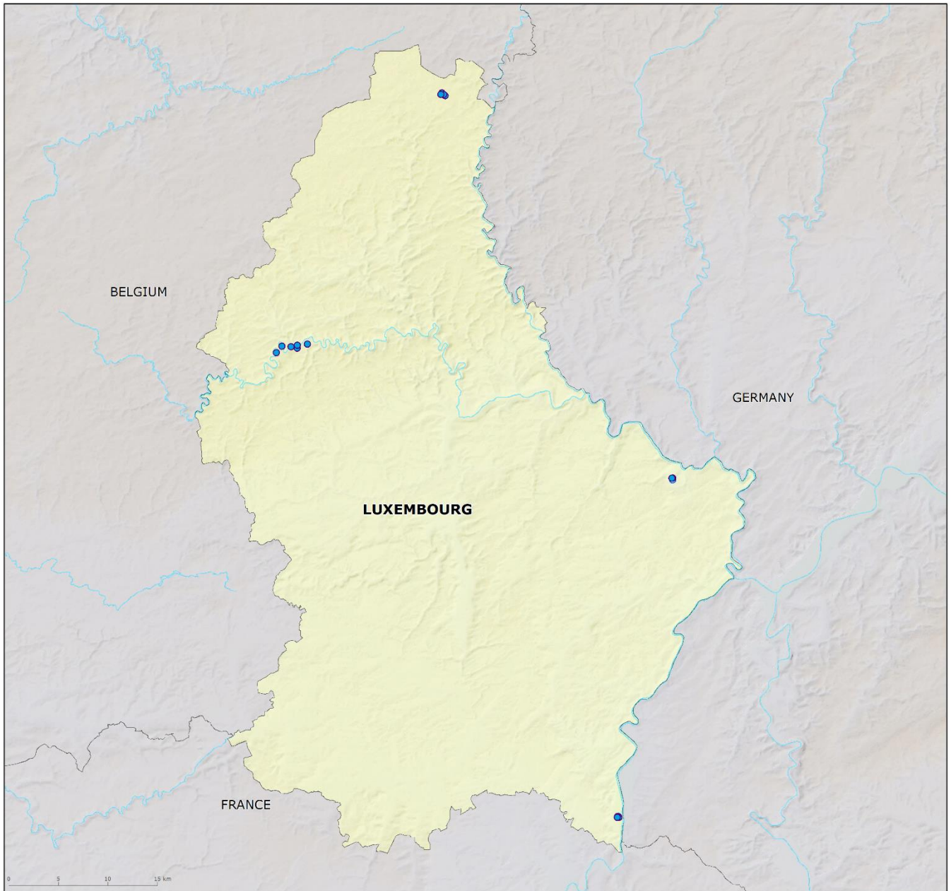
Map 1: Bathing waters reported during the 2023 bathing season in Luxembourg