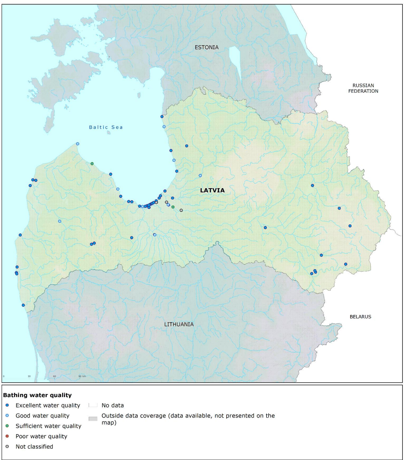
Map 1: Bathing waters reported during the 2023 bathing season in Latvia