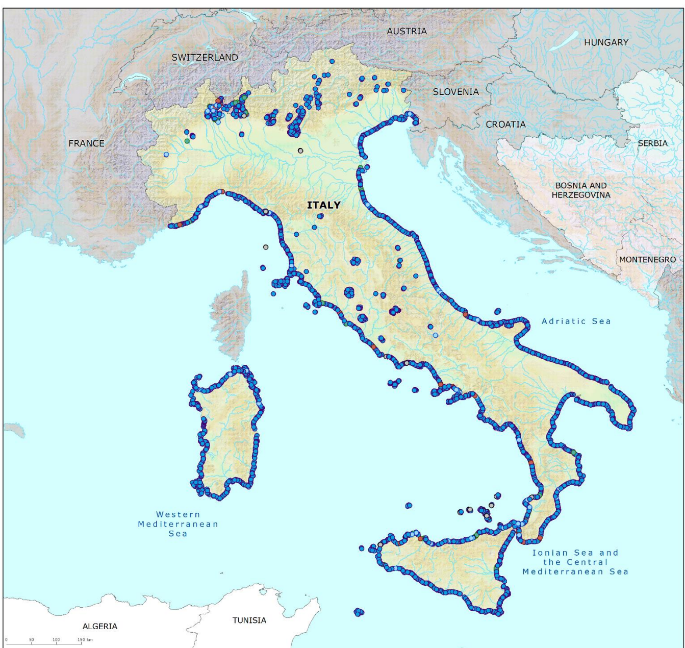
Map 1: Bathing waters reported during the 2023 bathing season in Italy