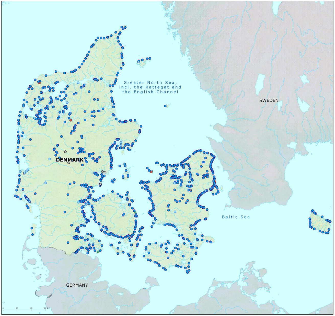
Map 1: Bathing waters reported during the 2023 bathing season in Denmark