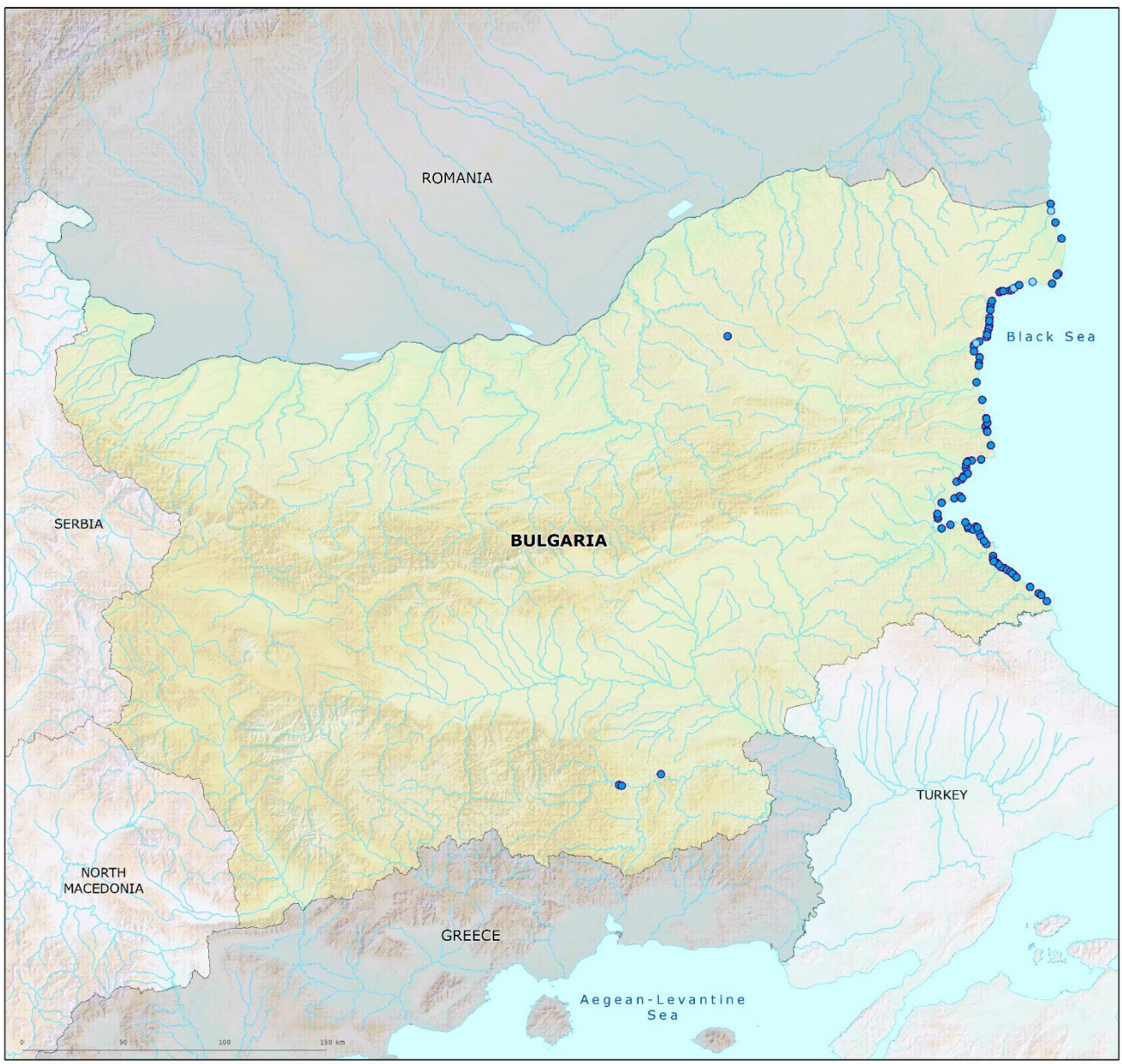
Map 1: Bathing waters reported during the 2023 bathing season in Bulgaria