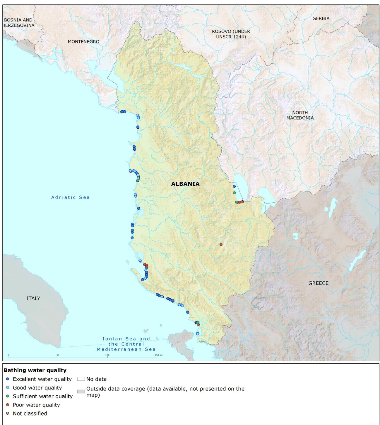
Map 1: Bathing waters reported during the 2023 bathing season in Albania