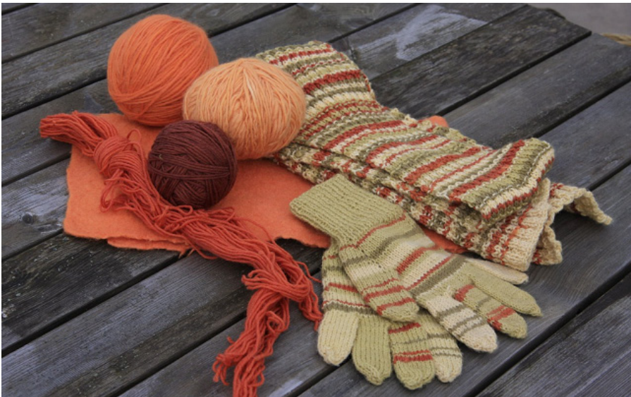
Photo: Example materials coloured with Cortinarius dyes © Gordon McInnes

together in the Finnish Guild of Dyers to share information on their craft and learn from each other. All have access to a range of websites to support their hobbies and professional interests, for example the virtual craft place ( www.kaspaikka.fi/engl/index.html ) and Textile Education and Research in Europe ( www.texere.u-net.dk ). The complex web of connections, in which webcaps play numerous valuable roles in human and natural systems, thus extends all the way to the world wide web.