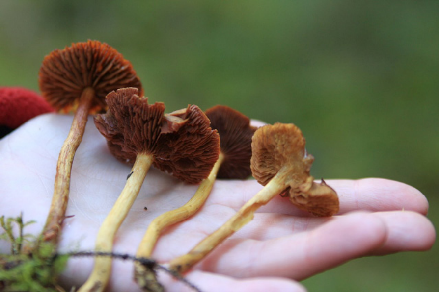
Photo: Cortinarius gentilis (left), semisanguineus (middle two) and sommerfeltii (right)