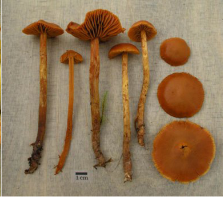
Cortinarius gentilis

stem; the next looks quite like the first but the stem is redder and the gills red-brown; the third is slightly different again.