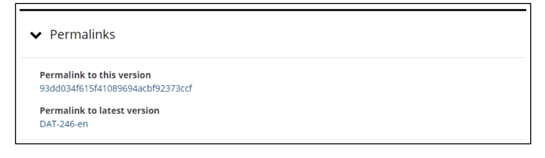
Figure 2 Overview of the content of the fiche of this dataset entry