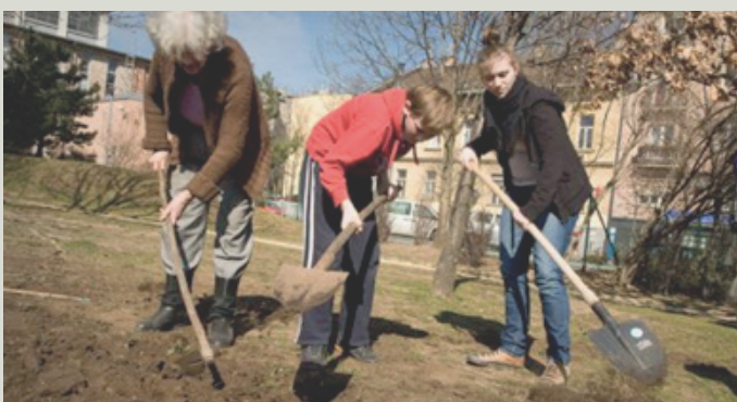
Urban community gardens initiatives in Hungary