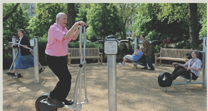
Hyde Park, London